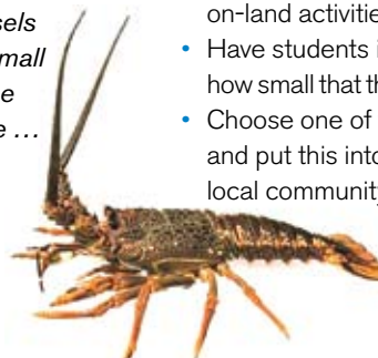
starters & strategies