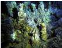
Remnant hydrothermal vent chimneys and bed of stalked barnacles (Clark seamount, southern Kermadec)