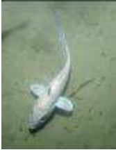
Macruronus carinata , one of the many species of rattail (Sub-Antarctic) NIWA