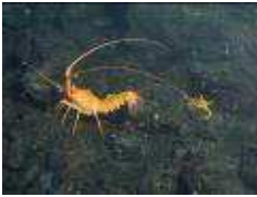
Deepwater rock lobster, projasus pakeri and brittle star (Rumble V seamount, Kermadec ridge)