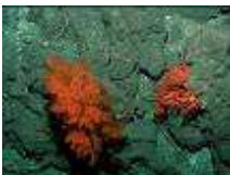
Black coral and Brisingid seastar (Fiordland) NIWA