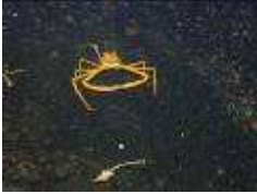
Spider (Deepwater) Crab NIWA