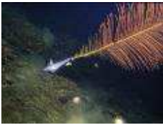
Grenadier cod and sea pen