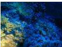
Bed of Bathymodiolid mussels (Giggenbach seamount, Kermadec)