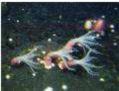
Soft coral Anthomastus robustus