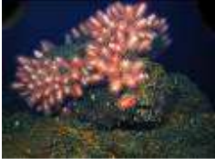
Sea urchins Dermechinus sp. (Rumble V seamount, Kermadec ridge) NOAA