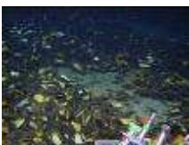
Bed of mussels NIWA