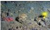
Scorpionfish and anemone (Giggenbach seamount) NIWA