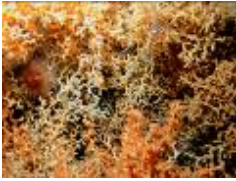
Stony coral, Solenosmilia variabilis , and sea urchin, Pseudechinus sp. (Macquarie Ridge region)