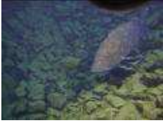
Spotted black groper

(Giggenbach seamount, close to Kermadec Islands, 100-150 metres depth)