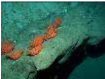
Brisingid seastar (Fiordland) NIWA